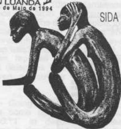
CORREIOS DE ANGOLA 1.º DIA DE CIRCULAÇÃO