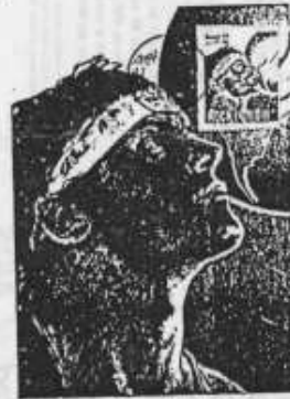
Freddie Mercury (1946 - 1991)

The first and only black male to win the US Open (1968) and Wimbledon (1975) tennis championships. He also founded the Arthur Ashe Foundation for the Defeat of Aids.