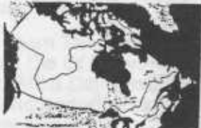
2nd Canadian World AIDS Day Philatelic Exhibition VANCOUVER, BC, CANADA