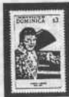
Liberace (1919 - 1987)

The first "celebrity" to receive world-wide attention when, in 1985, he died of AIDS.