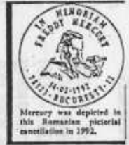
Freddie Mercury (1946 - 1991)

Lead singer and lyricist for the rock group Queen, died November 24, 1991, from AIDS-related pneumonia. Mercury was depicted in this Romanian pictorial cancellation in 1992.