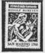
Rudolph Nureyev (1946 - 1992)

World famous, Russian born, ballet star Rudolf Nureyev died of complications from AIDS on March 23, 1992.