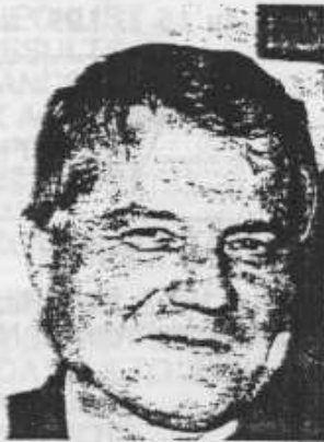
Dr. Luc Montagnier, Pasteur Institute.

We have been given some information from our contact in Germany regarding a first for Germany. The very first special cancel on HIV in Germany will appear on February 20, 1998, together with a special commemorative postcard showing the portrait of Luc Montagnier. Both issues are based on the private initiative of a German group of collectors of Medical philatelic items (Motivgruppe Medizin of the German Philately Society). This postcard will be available only at a local bank of a small town in Northern Germany, whereas the cancel will be used for one month at the post office of the same town. This cancel could be ordered from the "Deutsche Post AG, D-53253 Bonn, Germany."